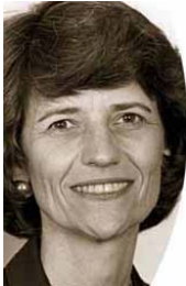
Elizabeth Johnston Patterson United States Representative, 1987–1993 Democrat from South Carolina

Corinne Riley won a special election to fill the last nine months of the term of her late husband, John J. Riley. She became the fourth widow to represent South Carolina. During her brief eight-month term, Riley supported authorizing the Federal Communications Commission to require that television sets be equipped with high-frequency channels, a proposal she hoped would benefit an educational television system operating in her district. “We in South Carolina have worked long and hard to preserve this valuable resource which we call our VHF channel in Columbia,” Riley noted in her brief and only floor speech as a Member.