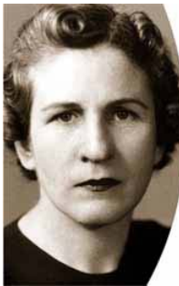
Clara G. McMillan United States Representative, 1939–1941 Democrat from South Carolina

Elizabeth Hawley Gasque, the first woman U.S. Representative from South Carolina, filled a vacancy caused by the death of her husband, U.S. Representative Allard H. Gasque in 1938.