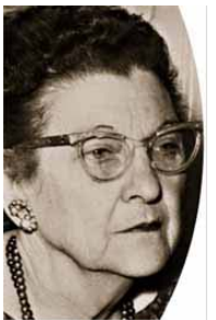
Corinne Boyd Riley United States Representative, 1962–1963 Democrat from South Carolina

Willa Fulmer worked as an aide to her husband, Congressman Hampton P. Fulmer, in the early 1930s. She earned $266 dollars per month, which put her in the upper salary bracket for Capitol Hill staff at the time. In 1944, she filled her husband's seat after his death, long enough for party officials to successfully insert long-term successor, John J. Riley. Congress adjourned a month after she took her seat.