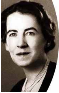
Elizabeth H. Gasque United States Representative, 1938–1939 Democrat from South Carolina

Elizabeth Hawley Gasque, the first woman U.S. Representative from South Carolina, filled a vacancy caused by the death of her husband, U.S. Representative Allard H. Gasque in 1938.